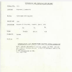
K1937 - Condition and restoration record, circa 1950s-1960s