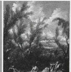
K1936 - Photograph, circa 1930s-1960s