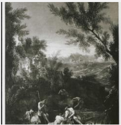
K1937 - Photograph, circa 1930s-1960s