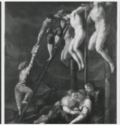
K2105 - Photograph, circa 1930s-1960s