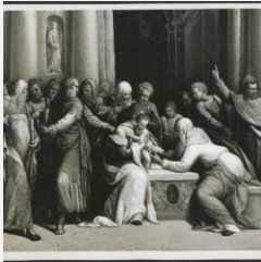
K2143 - Photograph, circa 1930s-1960s