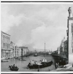
K2173 - Photograph, circa 1930s-1960s