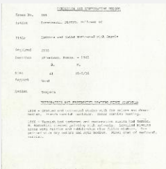
K0265 - Condition and restoration record, circa 1950s-1960s