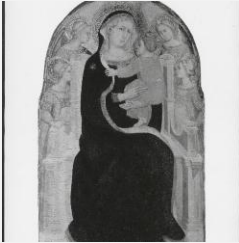
K0265 - Photograph, circa 1930s-1960s