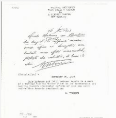
K0265 - Expert opinion by A. Venturi, 1936