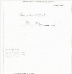
K0265 - Expert opinion by Berenson, circa 1920s-1950s