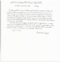
K0265 - Expert opinion by Longhi, 1933