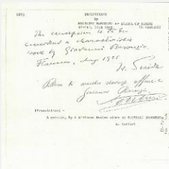
K0029 - Expert opinion by Suida et al., 1935