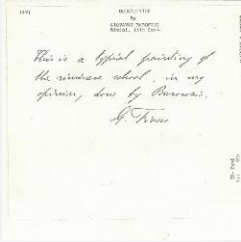
K0029 - Expert opinion by Fiocco, circa 1930s-1940s