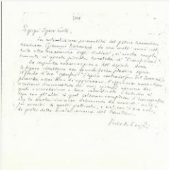
K0029 - Expert opinion by Berenson et al., circa 1920s-1950s