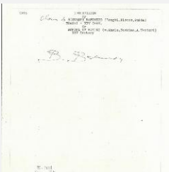
K0029 - Expert opinion by Berenson, circa 1920s-1950s