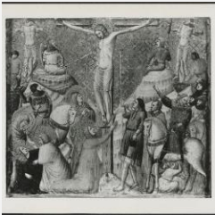
K0029 - Photograph, circa 1930s-1960s