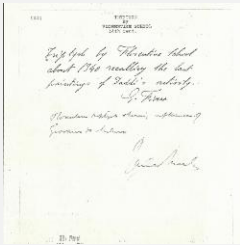
K0033 - Expert opinion by Fiocco et al., circa 1930s-1940s