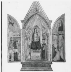
K0033 - Photograph, circa 1930s-1960s