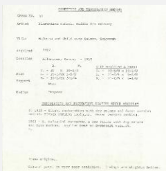
K0033 - Condition and restoration record, circa 1950s-1960s