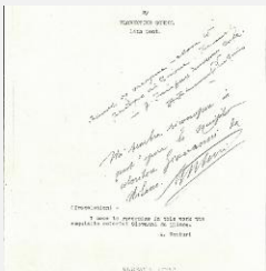
K0033 - Expert opinion by Perkins et al., circa 1920s-1940s