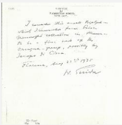
K0033 - Expert opinion by Suida, 1935