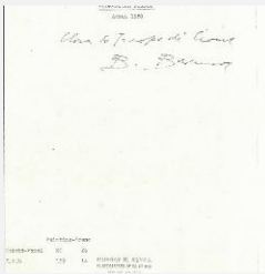
K0033 - Expert opinion by Berenson, circa 1920s-1950s