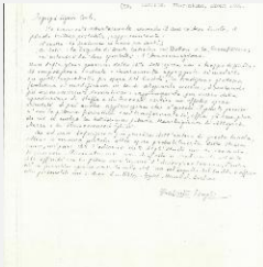
K0033 - Expert opinion by Berenson et al., circa 1920s-1950s