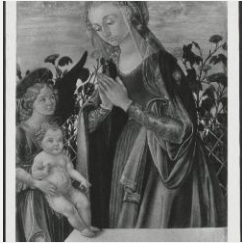
K0369 - Expert opinion by Fiocco et al., circa 1930s-1940s