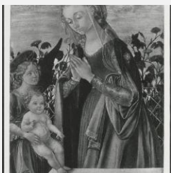
K0369 - Expert opinion by A. Venturi, 1936