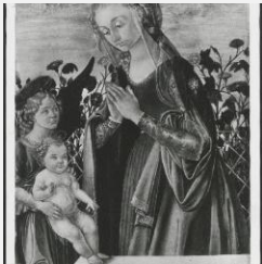
K0369 - Art object record, circa 1930s-1950s