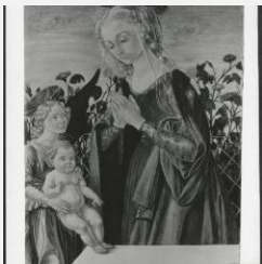
K0369 - Photograph, circa 1930s-1960s