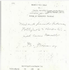
K0054 - Expert opinion by Berenson, circa 1920s-1950s