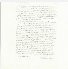
K0054 - Expert opinion by Longhi et al., 1929