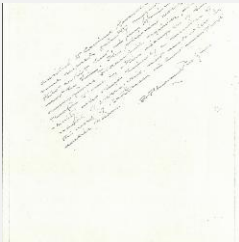
K0054 - Expert opinion by Perkins, circa 1920s-1940s