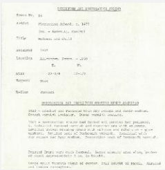
K0054 - Condition and restoration record, circa 1950s-1960s