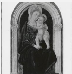
K0054 - Photograph, circa 1930s-1960s