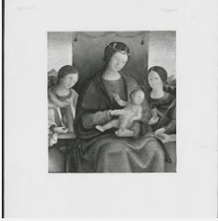
K0579 - Art object record, circa 1930s-1950s