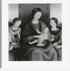
K0579 - Photograph, circa 1930s-1960s