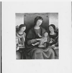
K0579 - Expert opinion by Suida, 1940