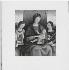
K0579 - Expert opinion by Longhi, 1939