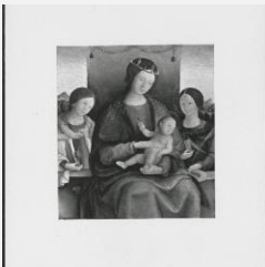
K0579 - Expert opinion by Fiocco, 1939