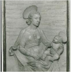
KSF05D - Photograph, circa 1930s-1960s