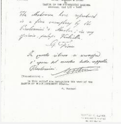
KSF05D - Expert opinion by Fiocco et al., circa 1930s-1940s