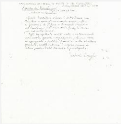
KSF05D - Expert opinion by Longhi, circa 1920s-1950s