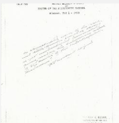
KSF05D - Expert opinion by Perkins, circa 1920s-1940s