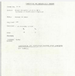
KSF05D - Condition and restoration record, circa 1950s-1960s