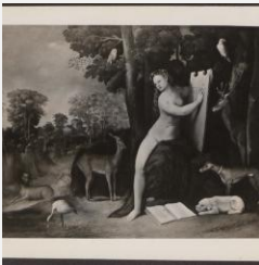
K1323 - Art object record, circa 1930s-1950s