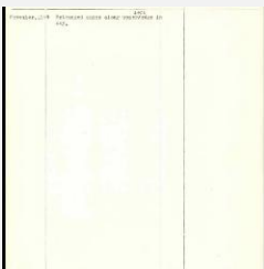
K1323 - Work summary log, 1944