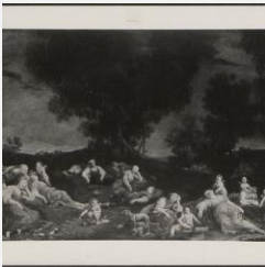
K0129 - Art object record, circa 1930s-1950s