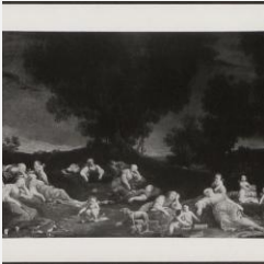
K0129 - Expert opinion by Fiocco, circa 1930s-1940s