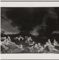
K0129 - Expert opinion by Suida, 1935