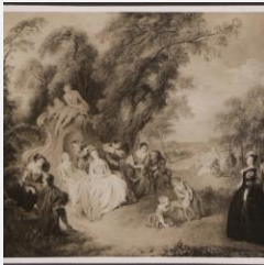
K1408 - Art object record, circa 1930s-1950s