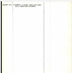
K1408 - Work summary log, 1947