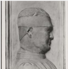
K1248 - Art object record, circa 1930s-1950s