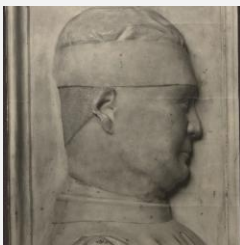
K1248 - Expert opinion by Planiscig, 1940