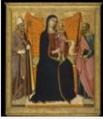
K69 Luca di Tommé Madonna and Child with Saints Nicholas and Paul Los Angeles County Museum of Art, Los Angeles, California

Type: purchase Attribution History: Acquired as Madonna and Child and Two Saints by Luca di Tommé Purchase Amount: USD 30,000.00