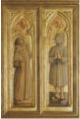
K72 Carlo Crivelli Saint Francis Receiving the Stigmata Portland Art Museum, Portland, Oregon

Type: purchase Attribution History: Acquired as Christ with Saints, Angels, and Two Donors by Defendente Ferrari Purchase Amount: USD 10,000.00