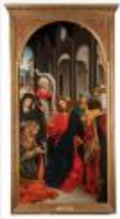
K70 Defendente Ferrari Christ in the House of Martha and Mary Magdalene Denver Art Museum, Denver, Colorado

Type: purchase Attribution History: Acquired as Madonna and Child and Two Saints by Luca di Tommé Purchase Amount: USD 30,000.00