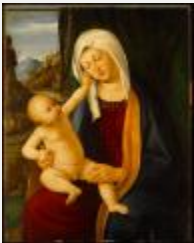
K91 Marco Basaiti Madonna and Child Allentown Art Museum, Allentown, Pennsylvania

Type: purchase Attribution History: Acquired as Saint by Carlo Crivelli Note: K72 and K73 purchased together for $6,500.