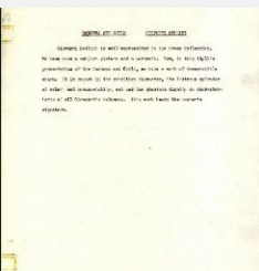
K0479 - Art object record, circa 1950s-1960s