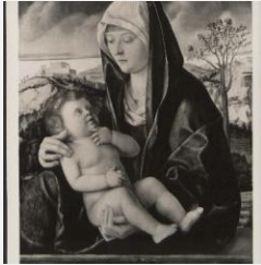
K0479 - Expert opinion by Fiocco, 1938