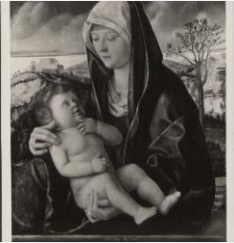
K0479 - Expert opinion by A. Venturi, circa 1920s-1930s