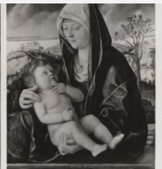
K0479 - Art object record, circa 1930s-1950s