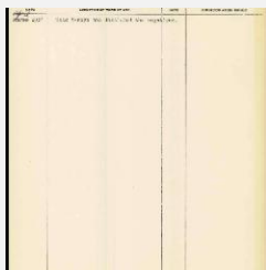
K1659 - Work summary log, 1964