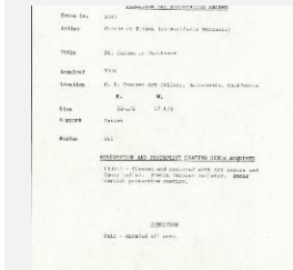
K1052 - Condition and restoration record, circa 1950s-1960s