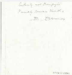
K1052 - Expert opinion by Berenson, circa 1920s-1950s