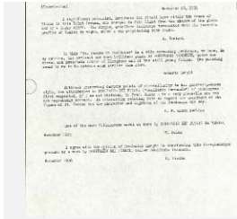
K1052 - Expert opinion by Fiocco et al., 1936