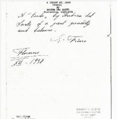
K1081 - Expert opinion by Fiocco, 1938