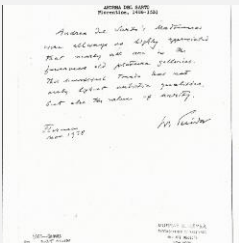
K1081 - Expert opinion by Suida, 1938