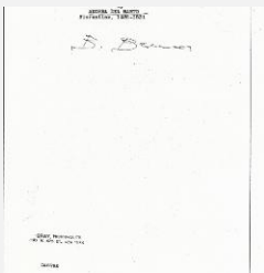
K1081 - Expert opinion by Berenson, circa 1920s-1950s