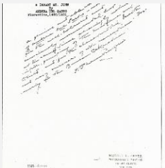
K1081 - Expert opinion by Perkins, circa 1920s-1940s