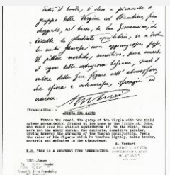
K1081 - Expert opinion by A. Venturi, circa 1920s-1930s