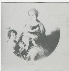
K1081 - Expert opinion by Berenson, circa 1920s-1950s