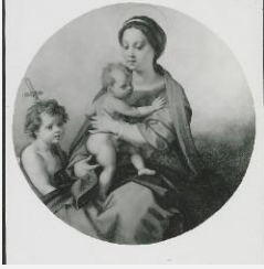
K1081 - Photograph, circa 1930s-1960s