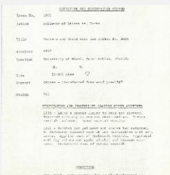
K1081 - Condition and restoration record, circa 1950s-1960s