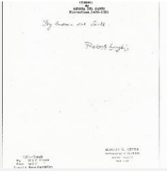
K1081 - Expert opinion by Longhi, circa 1920s-1950s