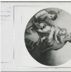
K1081 - National Gallery of Art mounted photograph, circa 1940s-1950s