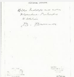
K1193 - Expert opinion by Berenson, circa 1920s-1950s