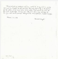
K1193 - Expert opinion by Longhi, 1939