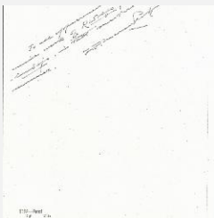
K1193 - Expert opinion by Perkins, circa 1920s-1940s