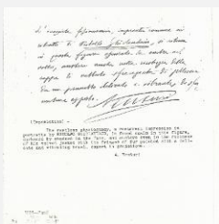
K1193 - Expert opinion by A. Venturi, circa 1920s-1930s