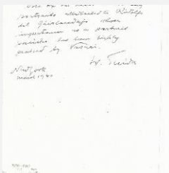
K1193 - Expert opinion by Suida, 1940