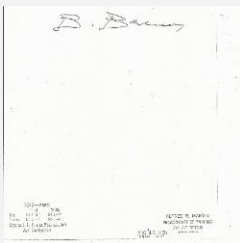
K1240 - Expert opinion by Berenson, circa 1920s-1950s