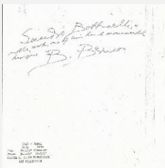
K1240 - Expert opinion by Berenson, circa 1920s-1950s