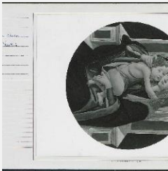
K1240 - National Gallery of Art mounted photograph, circa 1940s-1950s