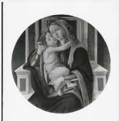
K1240 - Photograph, circa 1930s-1960s