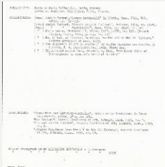
K1240 - Art object record, circa 1930s-1950s