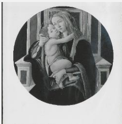
K1240 - Photograph, circa 1930s-1960s