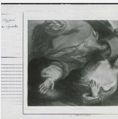
K1266 - National Gallery of Art mounted photograph, circa 1940s-1950s