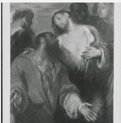
K1266 - Photograph, circa 1930s-1960s