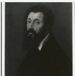
K1279 - Photograph, circa 1930s-1960s