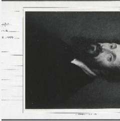
K1279 - National Gallery of Art mounted photograph, circa 1940s-1950s