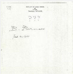
K1279 - Expert opinion by Berenson, 1945