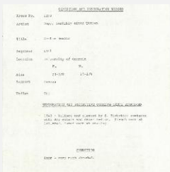
K1279 - Condition and restoration record, circa 1950s-1960s