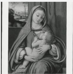
K1374 - Photograph, circa 1930s-1960s