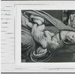
K1374 - National Gallery of Art mounted photograph, circa 1940s-1950s