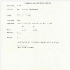
K1541 - Condition and restoration record, circa 1950s-1960s