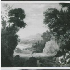
K1541 - Photograph, circa 1930s-1960s