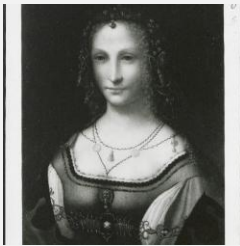
K1558 - Photograph, circa 1930s-1960s