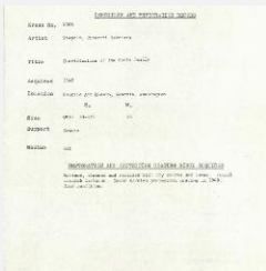
K1558 - Condition and restoration record, circa 1950s-1960s