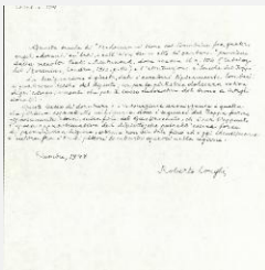
K1624 - Expert opinion by Longhi, 1948