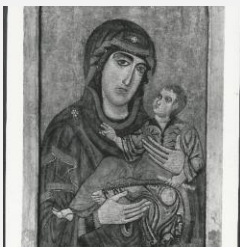
K1715 - Photograph, circa 1930s-1960s