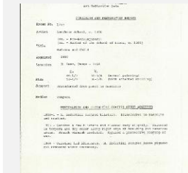
K1715 - Condition and restoration record, circa 1950s-1960s