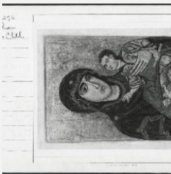
K1715 - National Gallery of Art mounted photograph, circa 1940s-1950s