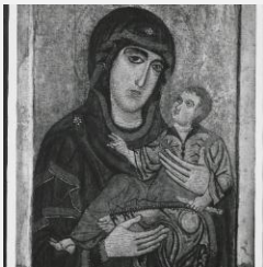
K1715 - Photograph, circa 1930s-1960s