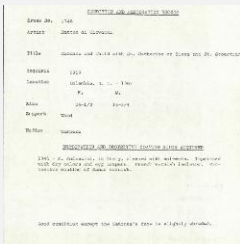
K1746 - Condition and restoration record, circa 1950s-1960s