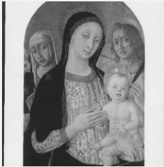
K1746 - Photograph, circa 1930s-1960s