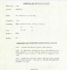
K1750 - Condition and restoration record, circa 1950s-1960s