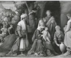
K1750 - Photograph, circa 1930s-1960s