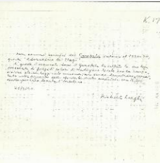
K1750 - Expert opinion by Longhi, 1950