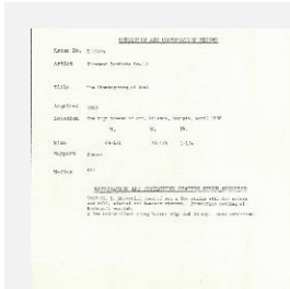
K1774B - Condition and restoration record, circa 1950s-1960s