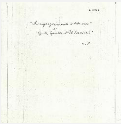
K1774B - Expert opinion by Longhi, circa 1920s-1950s