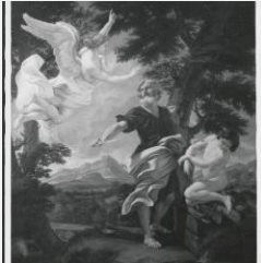
K1774A - Photograph, circa 1930s-1960s