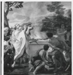
K1774B - Photograph, circa 1930s-1960s