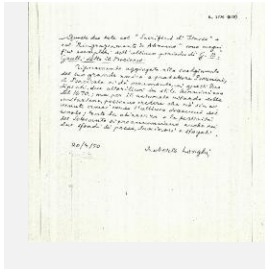
K1774A - Expert opinion by Longhi, 1950