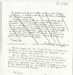
K1798 - Expert opinion by Longhi, 1950