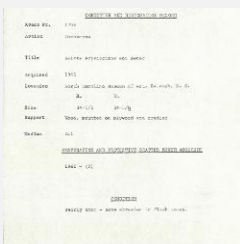
K1798 - Condition and restoration record, circa 1950s-1960s