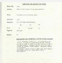
K1862 - Condition and restoration record, circa 1950s-1960s