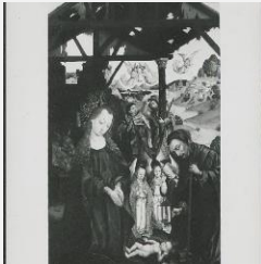
K1862 - Photograph, circa 1930s-1960s