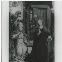
K1861 - Photograph, circa 1930s-1960s