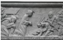
K2096 - Photograph, circa 1930s-1960s