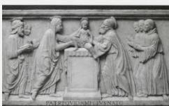
K2098 - Photograph, circa 1930s-1960s