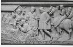
K2097 - Photograph, circa 1930s-1960s