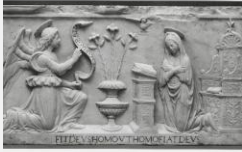
K2094 - Photograph, circa 1930s-1960s