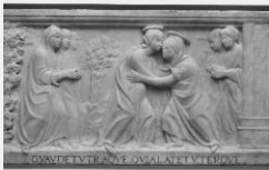
K2095 - Photograph, circa 1930s-1960s