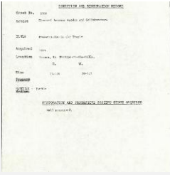
K2098 - Condition and restoration record, circa 1950s-1960s