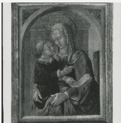
K0536 - Expert opinion by Suida, 1934