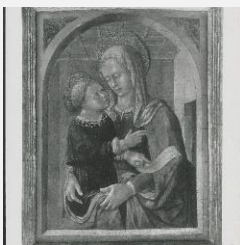
K0536 - Expert opinion by A. Venturi, 1934