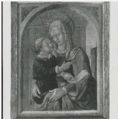
K0536 - Expert opinion by Longhi, 1934