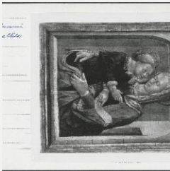
K0536 - National Gallery of Art mounted photograph, circa 1940s-1950s