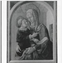
K0536 - Photograph, circa 1930s-1960s