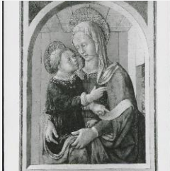
K0536 - Photograph, circa 1930s-1960s