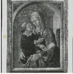
K0536 - Art object record, circa 1930s-1950s