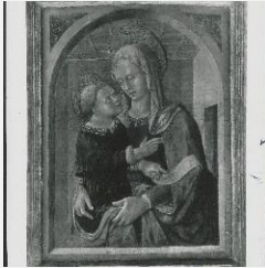
K0536 - Expert opinion by Fiocco, 1934