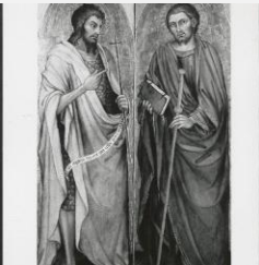
K0551 - Photograph, circa 1930s-1960s