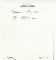
K0551 - Expert opinion by Berenson, circa 1920s-1950s