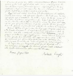
K0009 - Expert opinion by Longhi, 1930