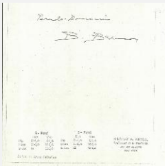
K0008 - Expert opinion by Berenson, circa 1920s-1950s