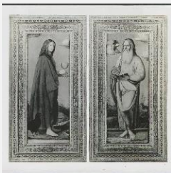
K0008 - Photograph, circa 1930s-1960s