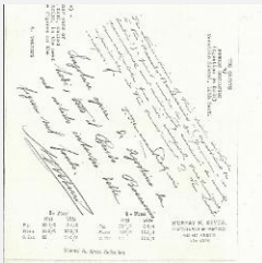
K0008 - Expert opinion by Perkins et al., circa 1920s-1940s