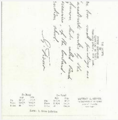
K0008 - Expert opinion by Fiocco, circa 1930s-1940s