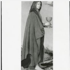
K0008 - Photograph, circa 1930s-1960s