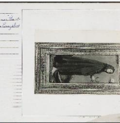
K0008 - National Gallery of Art mounted photograph, circa 1940s-1950s