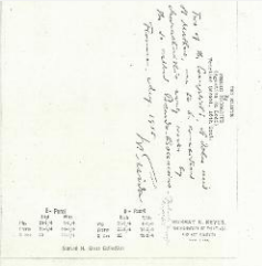
K0008 - Expert opinion by Suida, 1935