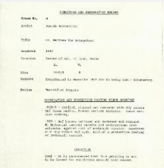
K0008 - Condition and restoration record, circa 1950s-1960s