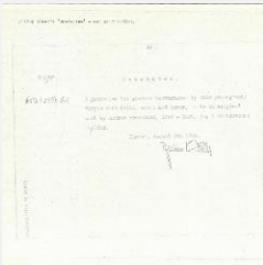
K0080 - Expert opinion by Böhler, 1924