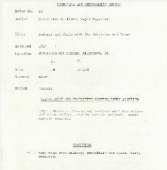
K0080 - Condition and restoration record, circa 1950s-1960s