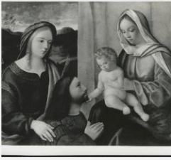
K0080 - Photograph, circa 1930s-1960s