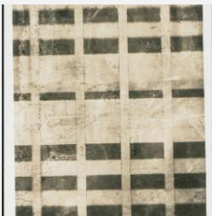
K0080 - Alan Burroughs report, circa 1930s-1940s