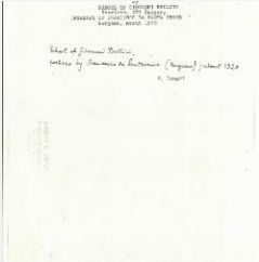
K0080 - Expert opinion by Longhi, circa 1920s-1950s