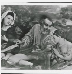
K00H1 - Photograph, circa 1930s-1960s