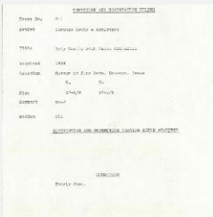
K00H1 - Condition and restoration record, circa 1950s-1960s