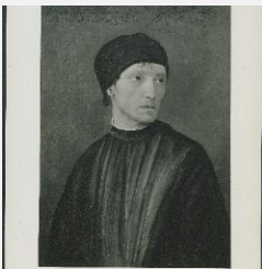
K00X7 - Expert opinion by Longhi, circa 1920s-1950s