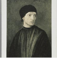
K00X7 - Expert opinion by Longhi et al., circa 1920s-1950s