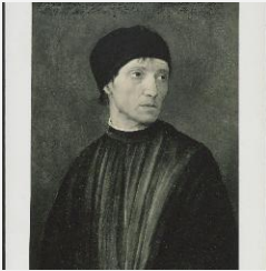
K00X7 - Expert opinion by Perkins, circa 1920s-1940s