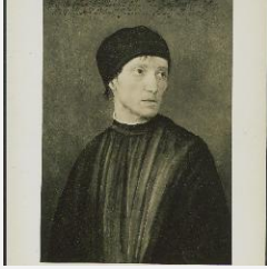
K00X7 - Art object record, circa 1930s-1950s