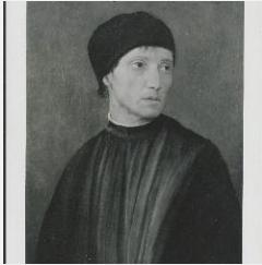
K00X7 - Photograph, circa 1930s-1960s