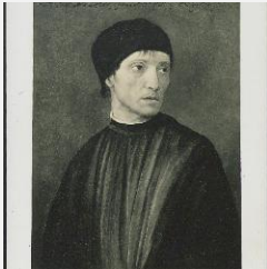
K00X7 - Expert opinion by Suida, 1935