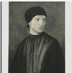
K00X7 - Expert opinion by Fiocco et al., circa 1930s-1940s