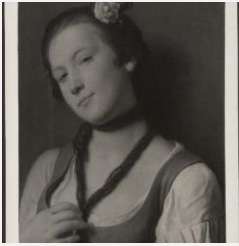
K0228B - Expert opinion by Suida, 1935