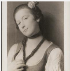
K0228B - Expert opinion by Berenson, circa 1920s-1950s